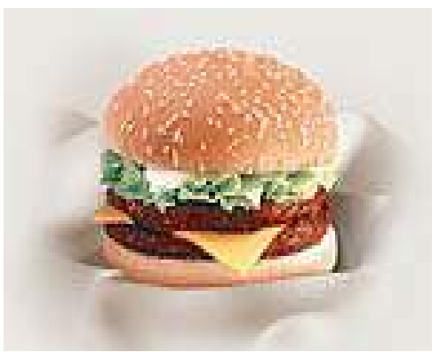
Bulbogi Burger, Korea