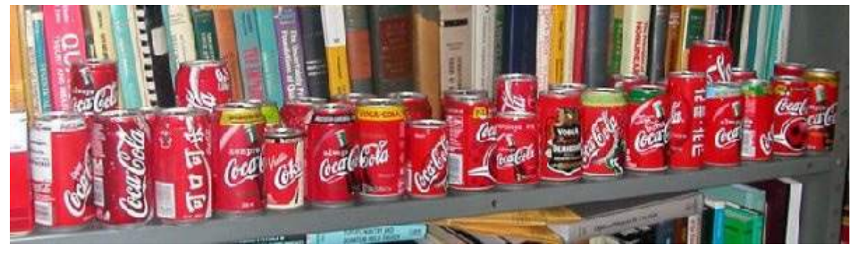
Coke Bottle in Different Countries

In which languages should labelling and instructions be printed? One approach to this issue is to print labels and instructions in languages that are used in all of the major markets for the product. The use of multiple languages on labels and instructions simplifies inventory control: The same packaging can be used for multiple markets. The savings from simplicity must be weighed against the cost of longer instruction booklets and more space on labels for information.